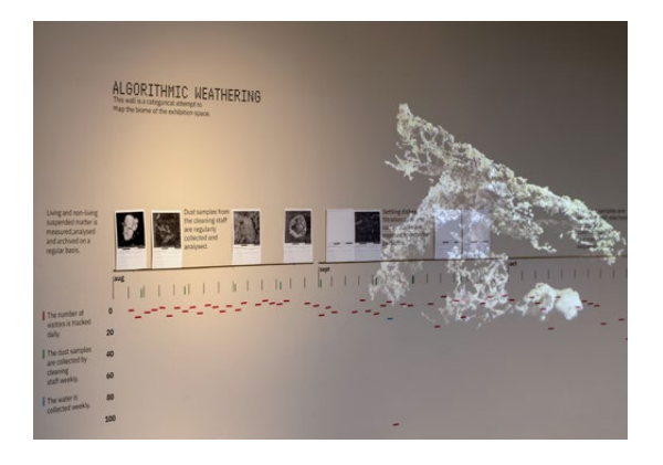
4: Clemens Winkler: Algorithmic Weathering, Sampling Wall, close up.

only that dust is multiple but that its composition alters, carrying shifting reverberations at different times. As with the rest of this exhibition, Winkler's dust installation sought to highlight modes in which materiality could be stretched, in this case by attending to these microscopic "material sediments," as he sometimes called them, and by showing them. In so doing, the work revealed the usually hidden activity of the exhibition space – which, at a stretch, we can call the museum – itself.