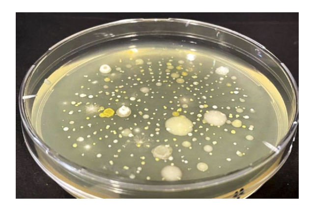
5: Clemens Winkler and Skander Hathroubi: Microbiome of Airborne Particles. Microbial sampling with Merck MAS-100 Eco Air Sampler in the exhibition space after visitors gathering.