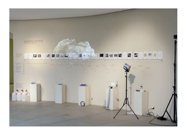
3: Clemens Winkler: Algorithmic Weathering, Sampling Wall.