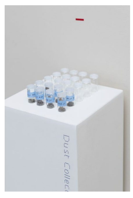
2: Clemens Winkler: Weekly dust samples collected with cleaning staff at the Veterinary Anatomy Theatre (TA T).

While some of these works invoke the reverberations of other times and places, and of the interactions of the contents – human and nonhuman – of gallery spaces, they do not directly investigate these.